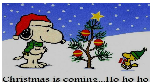
Christmas is coming...Ho ho ho

Sun, (MR) 9:00 a.m. (80); (NS) 11:00 a.m. (24)