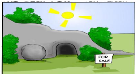
FOR SALE – Single owner tomb. Only used three days, and still has that new tomb smell. Reason for sale... resident was resurrected.

SUNDAY RADIO (9:00 am WEDO 810 AM) & INTERNET DIVINE LITURGY Liturgical Services LIVE: www.Youtube.com then type: Holy Ghost Church Live Stream