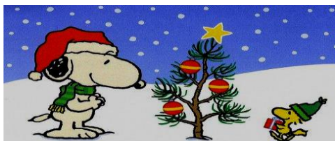
Christmas is coming...Ho ho ho

Sun., (MR) 9:00 a.m. (51); (NS) 11:00 a.m. (23)