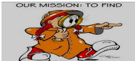
SOMEONE TO BLESS TODAY!