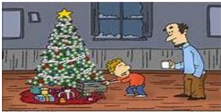
IT HAD A STAR ON TOP SO I FIGURED IT SHOULD HAVE A MANGER AT THE BOTTOM

Dec. 8 – Immaculate Conception — (MR) 9:00 a.m. (12); (NS) 6:00 p.m. (11)