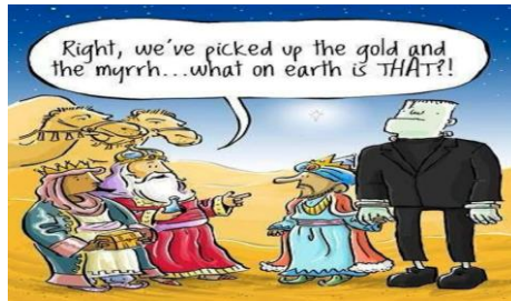
Right, we've picked up the gold and the myrrh...what on earth is THAT?!