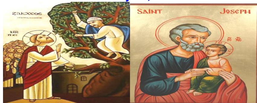
Catholics of the Ruthenian – Byzantine Rite in full communion with the Pope of Rome

The 1 st Pregreat Fast Sunday — The Year of St. Joseph January 17, 2021