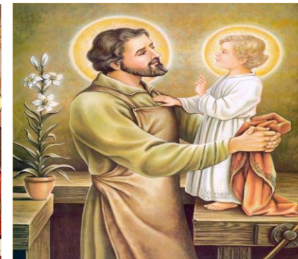
2020 – Year of St. Joseph – 2021

Catholics of the Ruthenian – Byzantine Rite in full communion with the Pope of Rome