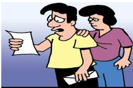
from our church... we've been called up for active duty."