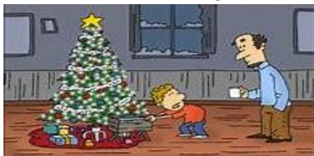
IT HAD A STAR ON TOP SO I FIGURED IT SHOULD HAVE A MANGER AT THE BOTTOM.

Dec. 8 – Immaculate Conception — Wed. (MR) 9:00 a.m. (10); (NS) 6:00 p.m. (14)