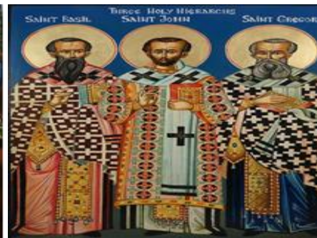
Catholics of the Ruthenian – Byzantine Rite in full communion with the Pope of Rome