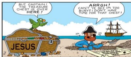
...to the acknowledgement of the mystery of God, and of the Father, and of Christ; in whom are hid all the treasures of wisdom and knowledge. — COLOSSIANS 2:2-3 KJV

Sun., (MR) 9:00 a.m. (69); (NS) 11:00 a.m. (28)