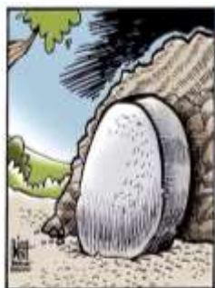
THE ORIGINAL ROCK

Sun., (MR) 9:00 a.m. (78); (NS) 11:00 a.m. (24)